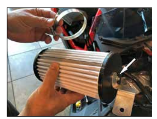
Fig. 1 Fig. 2 Fig. 3